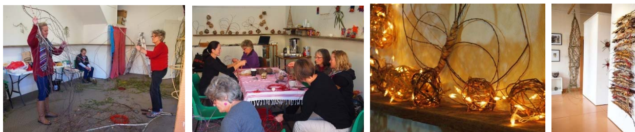
Week of Weaving