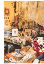
Open Studio Carole Pepper