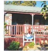
Wot a View Studio Gallery Leanne Lookwood

14 Little River Inn 15 Wot a View Studio Gallery 12 Ensay Winery 11 Old Pub Gallery