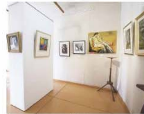
Great Alpine Gallery