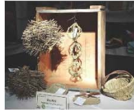
Old Standard Pop-Up Great Alpine Basketmakers and more