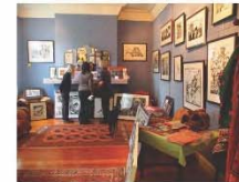
Old Pub Gallery