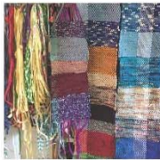
Exhibition@Little River Inn Textile artists